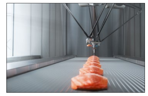
Filleting machines for fish, meat, etc. Suitable for wet areas