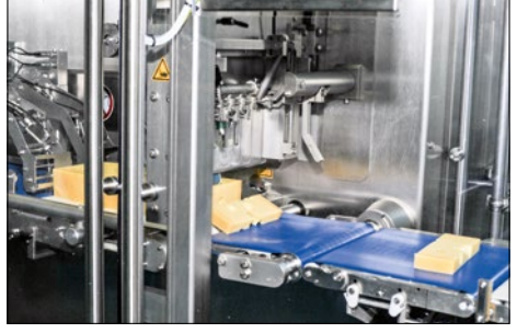
Cutting machine for cheese, sausages, etc. Tried and tested for food contact and daily cleaning intervals

For the toughest cleaning and disinfection requirements