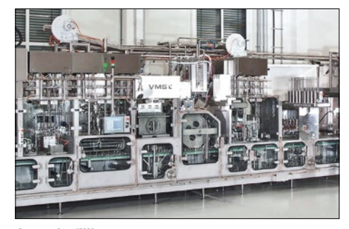
Aseptic filling systems

For the toughest cleaning and disinfection requirements